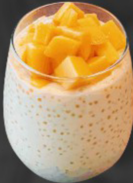
Y01 Mango Sago 香芋西米露