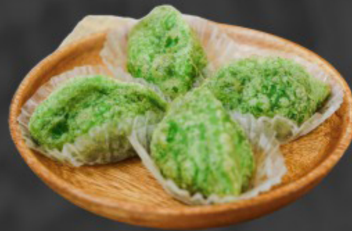
Y02 Chocolate Green Buchi 巧克力麻糍