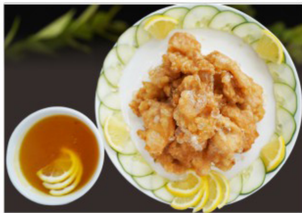
K02 Sautéed Chicken Cutlets with Lemon Sauce 柠檬鸡球 448.00