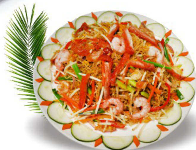
BEST SELLER T02 Curry Bihon "Singapore Style" 星州炒米 448.00