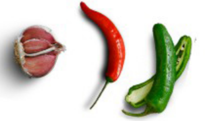
C01 Hongkong Date Lapu Lapu Fillet - Suahe Laksa 香港地喇沙海斑沙虾汤 1,600.00