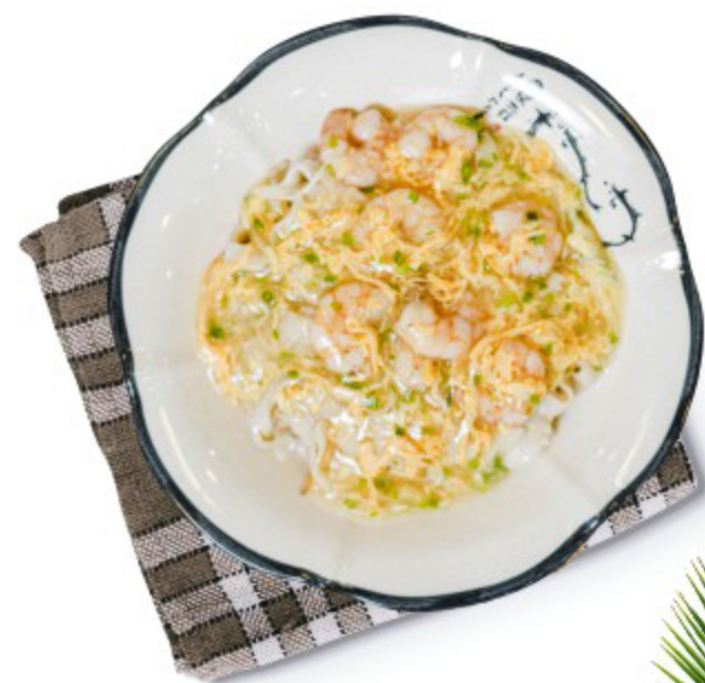
T01 Shrimp Whisked Egg Hofan (Wet) 滑蛋虾仁炒河 (湿炒) 468.00