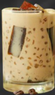
Y03 Coffee Jelly 咖啡啫喱冻