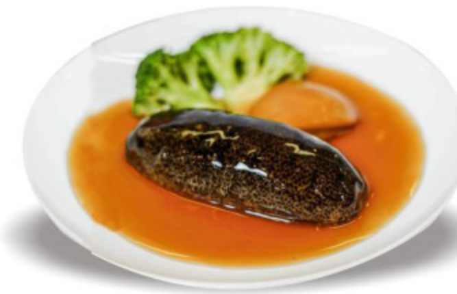
BEST SELLER E07 Braised Abalone Sea Cucumber 鲍鱼海参 (位上) 780.00