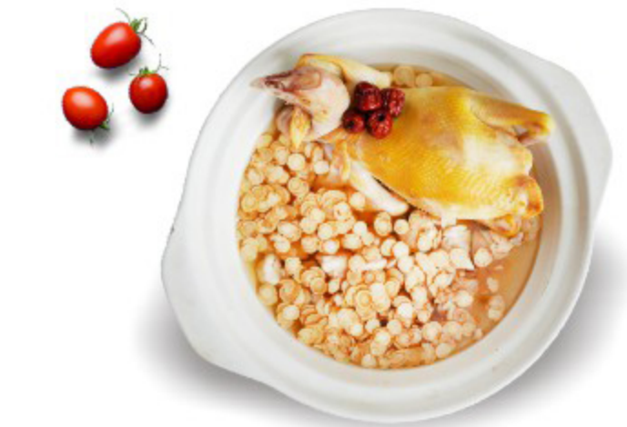
E09 W- Chicken Soup with "American Ginseng " 花旗参炖土鸡 2,600.00