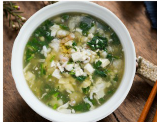
BEST SELLER C03 Seafood Spinach Soup 海鲜菠菜羹 438.00