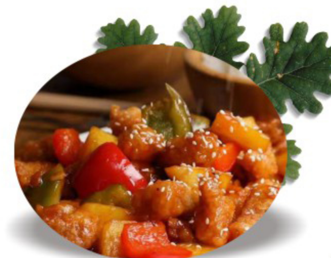
L11 Crispy Sweet and Sour Pork with Pineapple 脆皮咕嚕肉 468.00