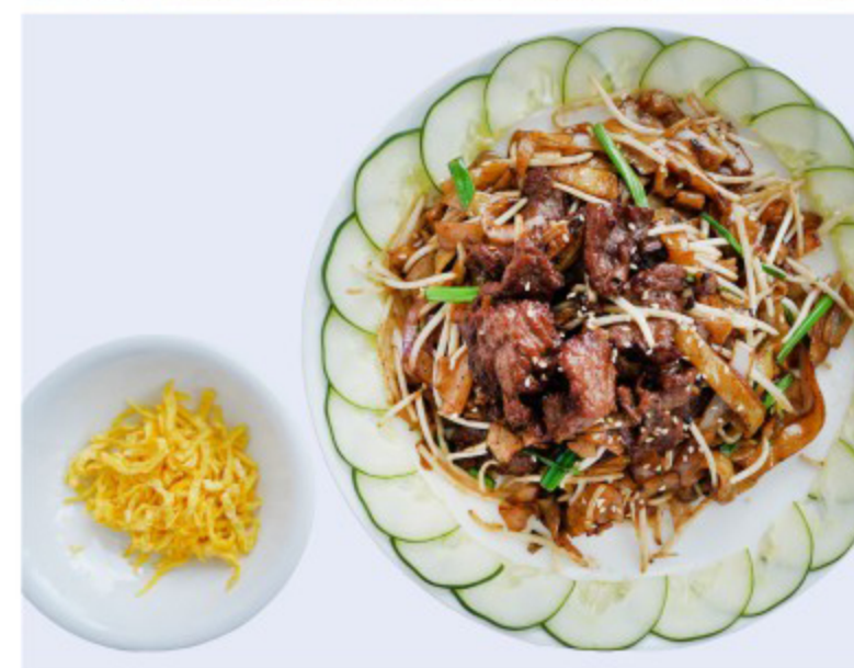
BEST SELLER T18 Wok Fried Beef Hofan "Hongkong Style" 干炒牛河 398.00