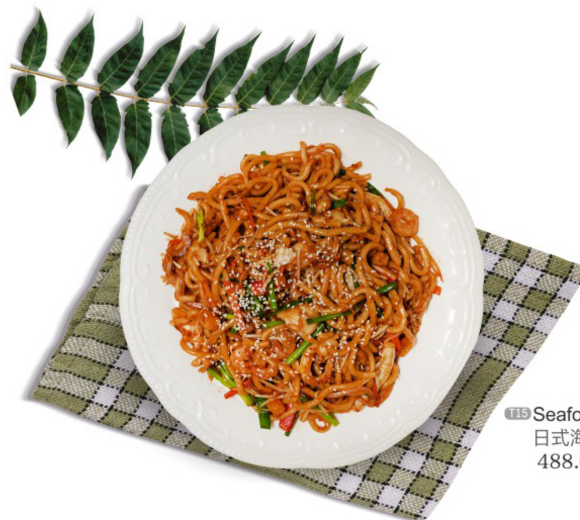
T15 Seafood Udon Noodle 日式海鲜炒乌冬 488.00