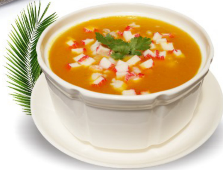
C02 Pumpkin Seafood Soup 南瓜海鲜羹 448.00