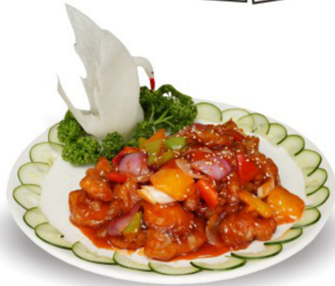
K01 Sweet and Sour Chicken 脆皮咕嚕鸡 468.00