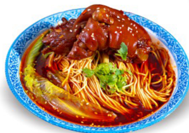
CHEF RECOMMENDATION T03 Pata Misua 猪手面线 698.00