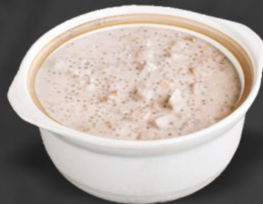
Y04 Hot Taro Sago 热香芋西米露