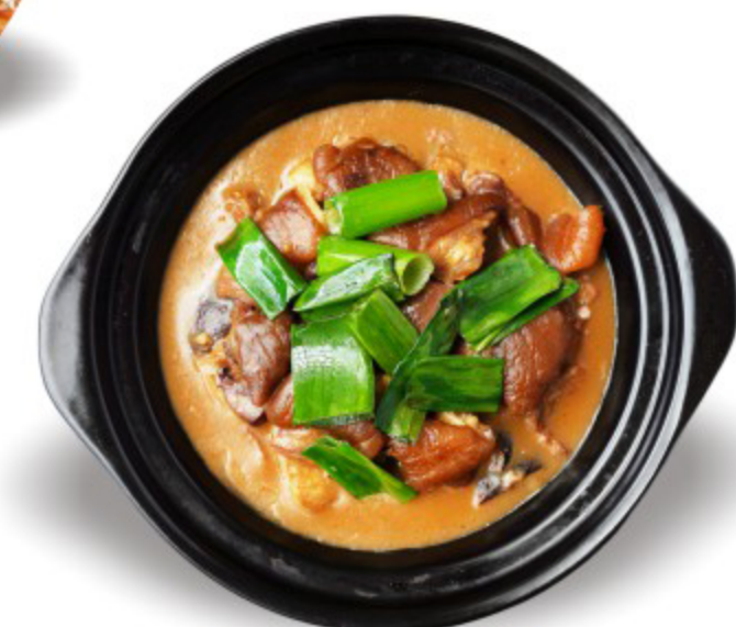
L12 Hongkong Date Lamb " Kambing Hotpot" 香港地羊肉煲 988.00