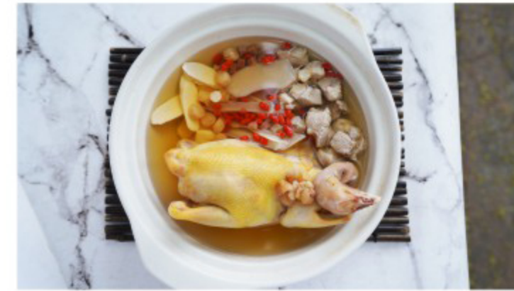
C01 W-Chicken Soup with " Yam Plum Screw" 淮山杞子螺片炖土鸡 2,600.00