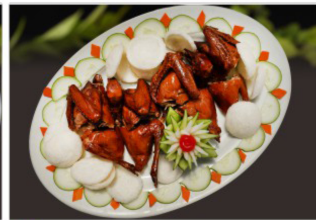
K08 Fried Pigeon ( per pc) 香港地炸乳鸽 720.00